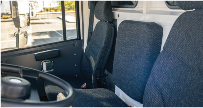
Seating for three; all forward facing with seat belts