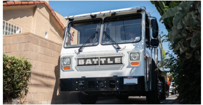
82" cab width; 12" narrower than our standard chassis for tight applications