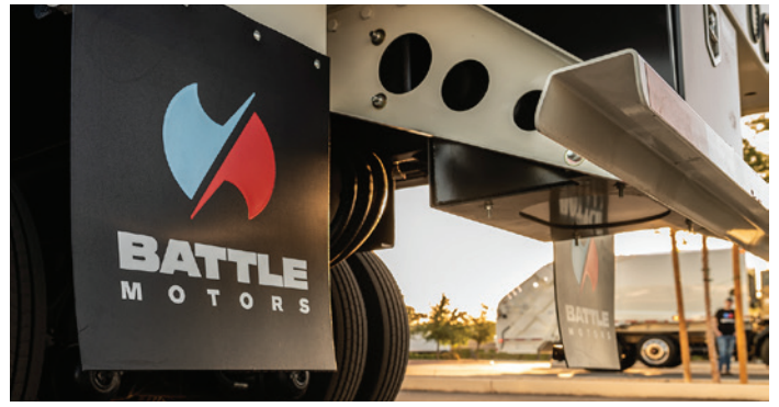
Cast steel, tubular crossmembers provide consistent strength fore and aft, side-to-side