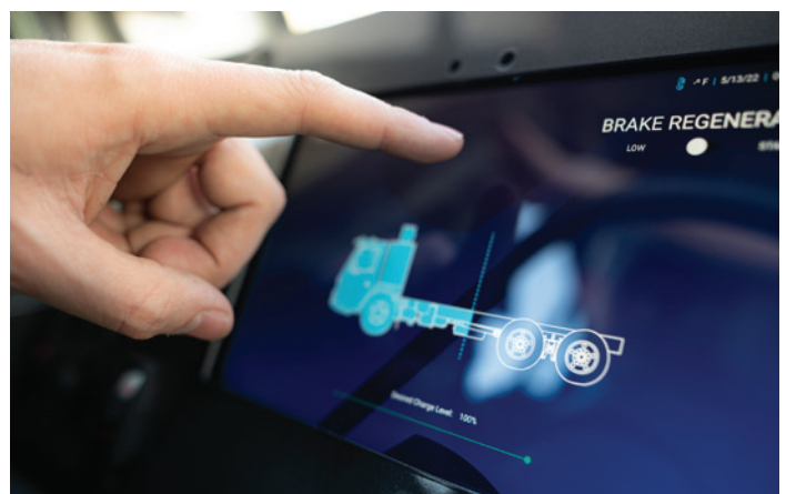
Power Conversion System (PCS)