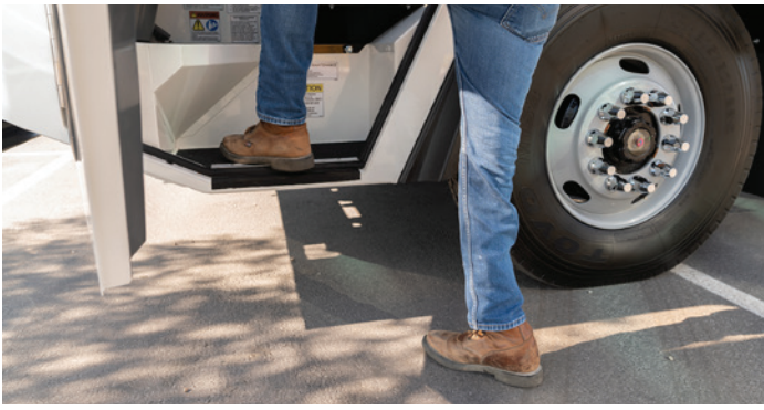
True low entry 18" step-in height on both sides